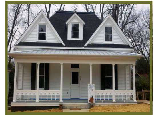
Pope Street Cottage

The Pope Street Cottage provides a safe and comfortable environment when supervised visits are appropriate. Off-site monitored and neutral drop-off visits are also offered.